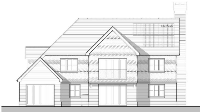
Proposed South-East Elevation 1:100 @ A1