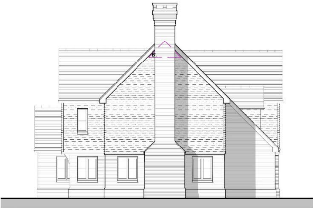
Proposed North-East Elevation 1:100 @ A1