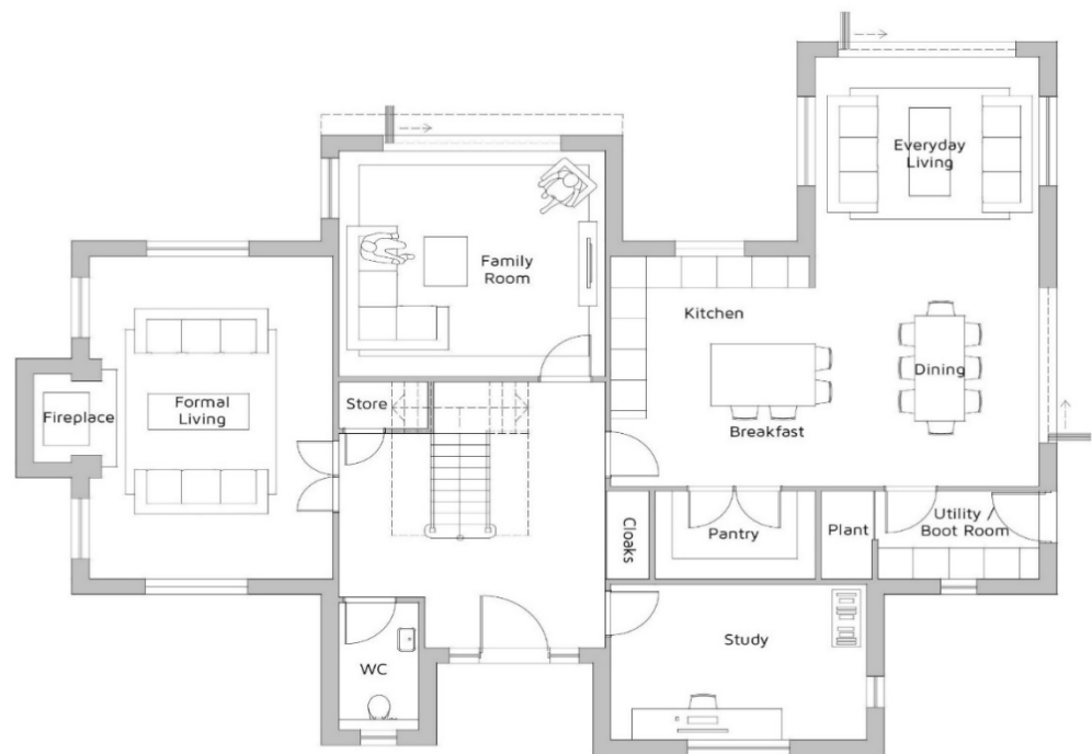
Proposed Ground Floor Plan 1:100 @ A1