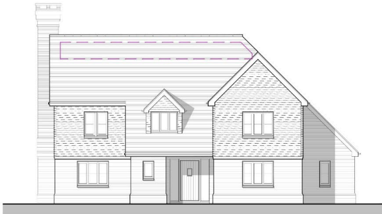
Proposed North-West Elevation 1:100 @ A1