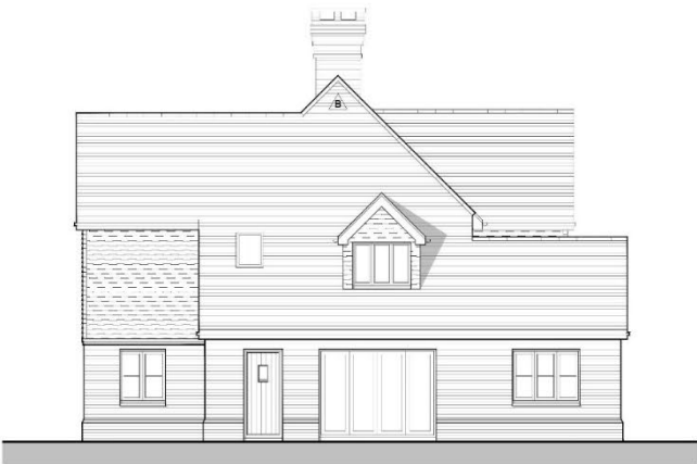
Proposed South-West Elevation 1:100 @ A1